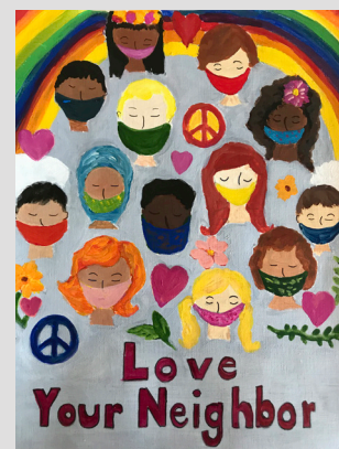
Sample mask poster

Jesus tells us to “Love others as well as you love yourself.” What better way to demonstrate how much we love others during this pandemic than by wearing a face mask? Let’s encourage each other and those around us with these two Arts at St. Bart’s ministry projects. Choose to create a poster or make a mask - or complete both! When finished, take a picture of your poster and/or of yourself wearing the face mask and send to arts@stbartschurch.org by August 9. Detailed instructions for the poster and mask can be found on the Arts at St. Bart’s webpage. Children and teens are encouraged to participate also.