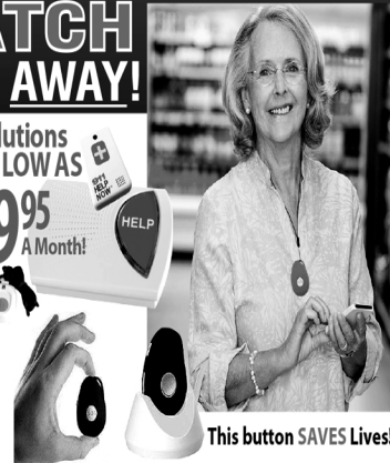
This button SAVES Lives!