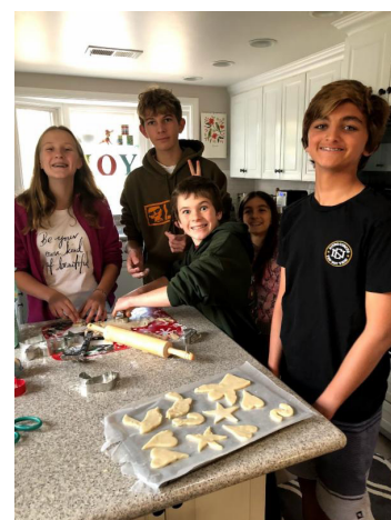
Youth CREW cookie party