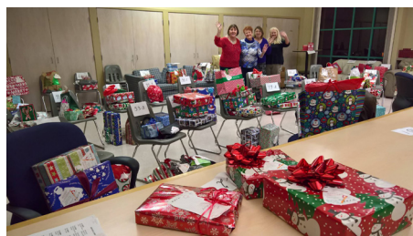
Angel Tree Gifts