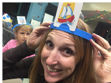
Family Game Night