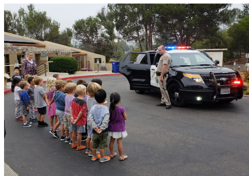
Preschool classes get a special visit from California Highway Patrol.

Looking forward to another wonderful year ahead!