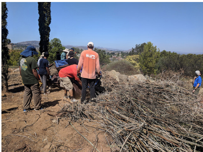
Troop 682 clearing brush at St. Bart's cross on the hill.