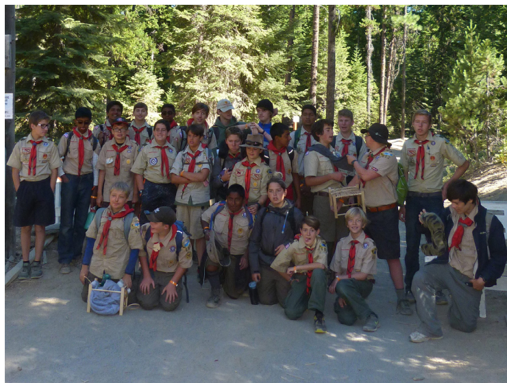
Troop 682 at Makualla Summer Camp.