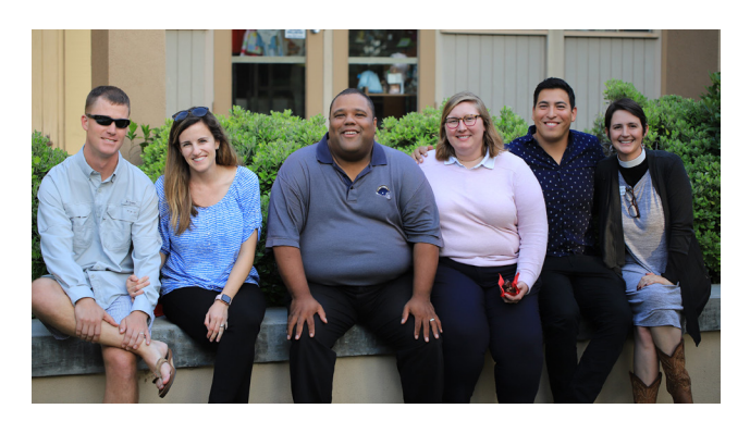
Sabbatical Soiree: Guatemala