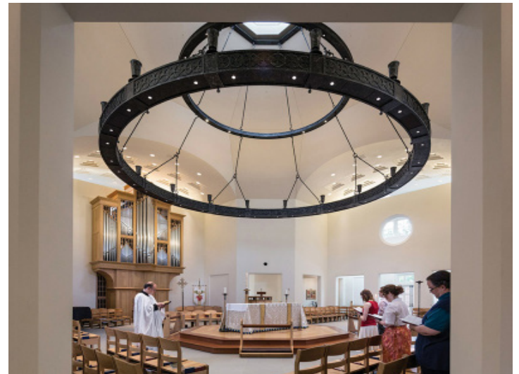
Virginia Theological Seminary Chapel