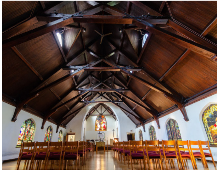
St. Martin's Episcopal Church, Chicago