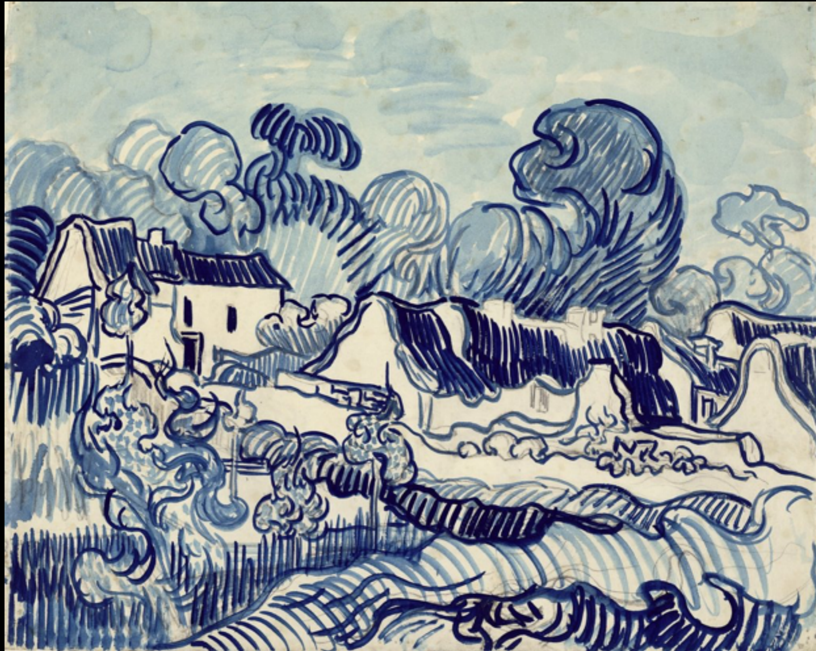
Van Gogh, Landscape with Houses (1890) Pencil, brush and oil paint and watercolor on paper 44.0 cm x 54.4 cm