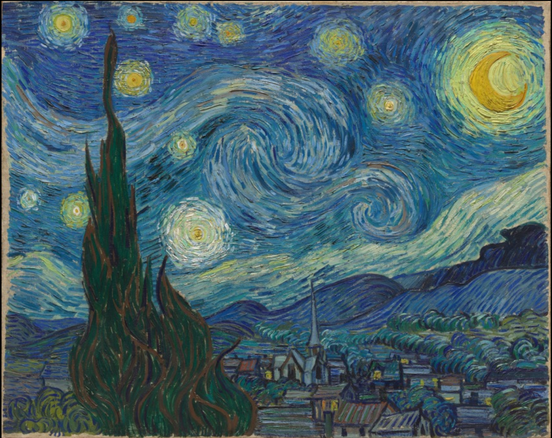
Van Gogh, The Starry Night (1889) Oil on canvas, 73.7 x 92.1 cm