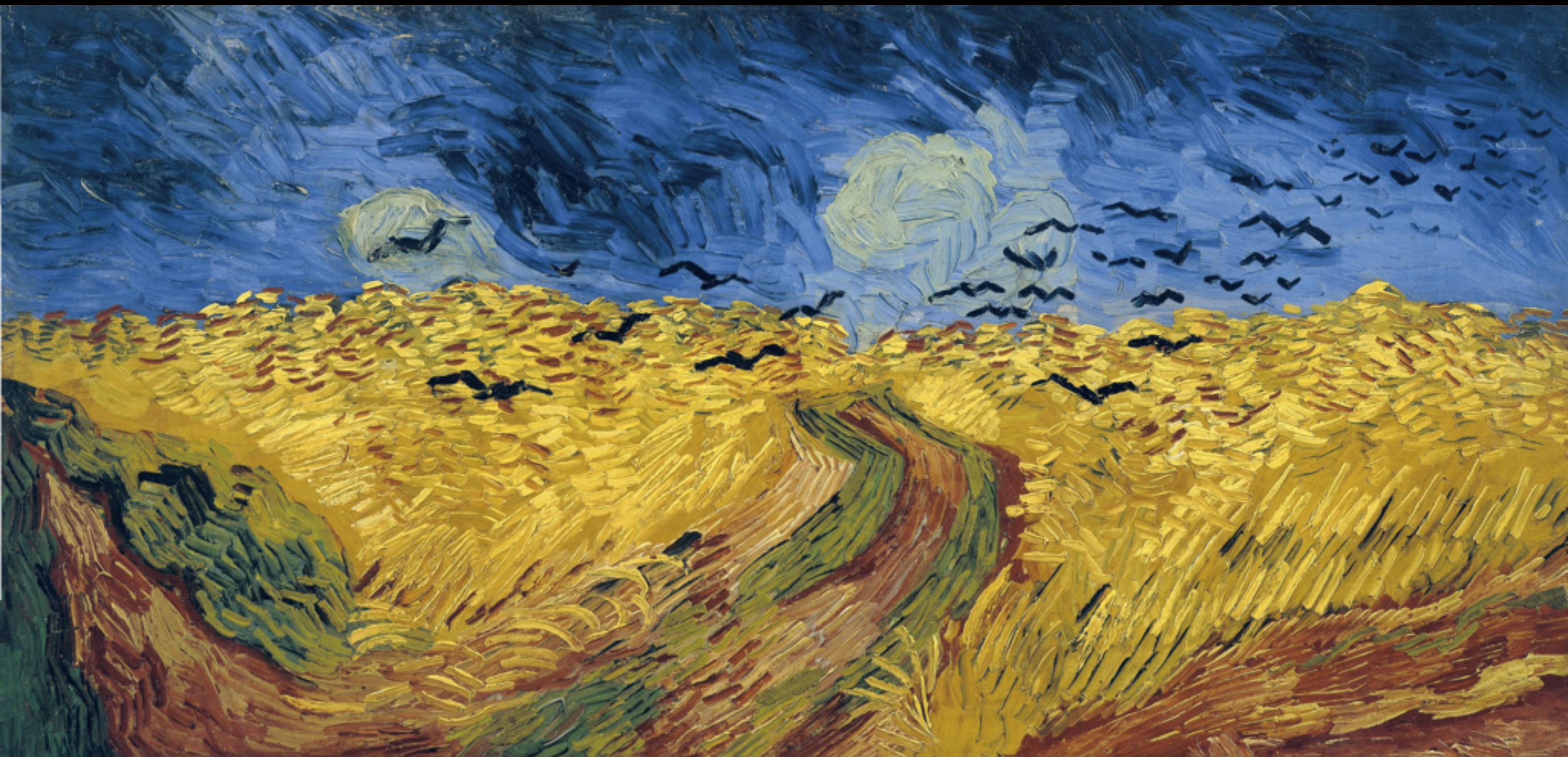
Van Gogh, Wheatfield with Crows (1890) Oil on canvas, 36 1/2 x 29 in