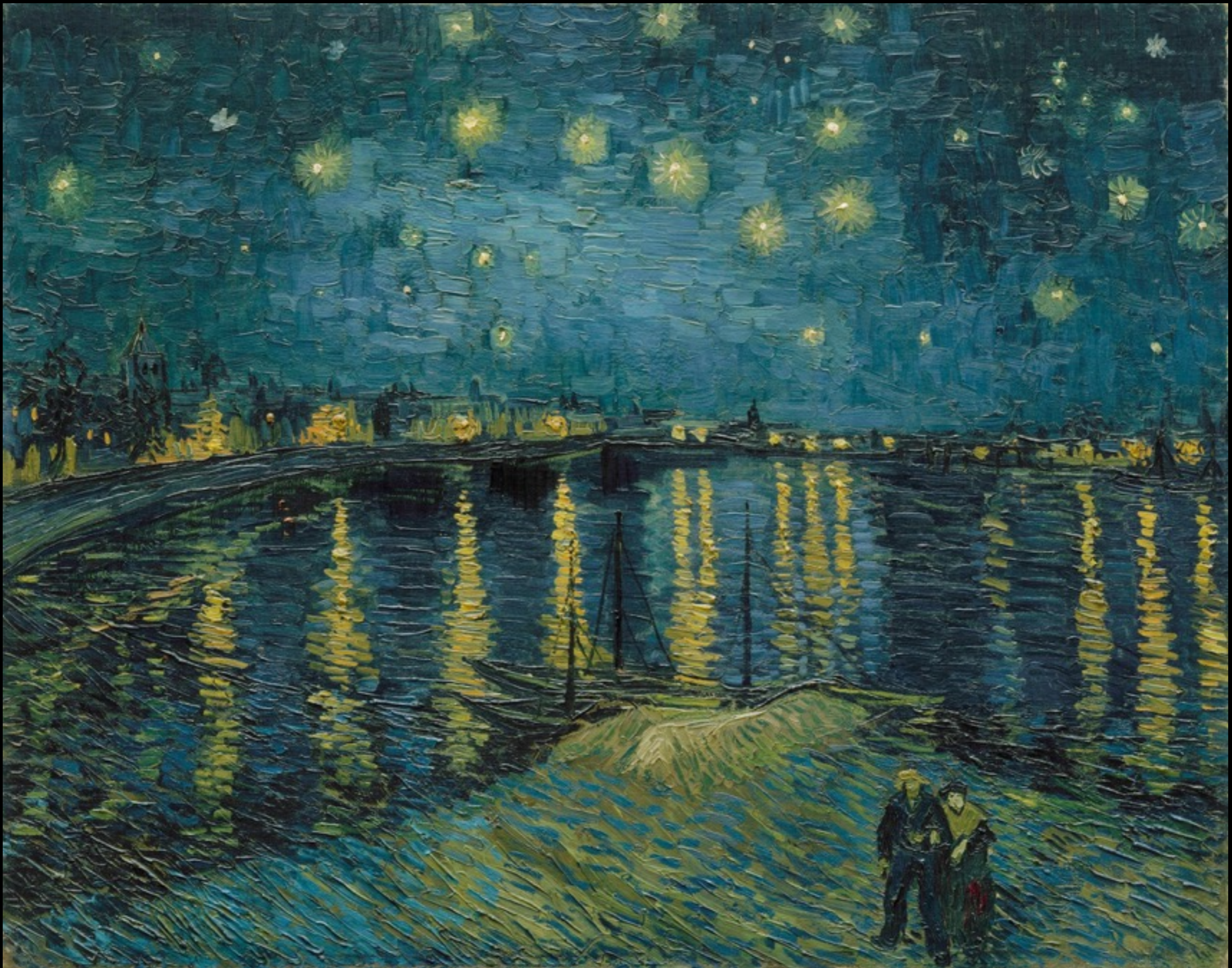
Van Gogh, Starry Night Over the Rhône (1888) Oil on canvas, 2' 5" x 3' 0"