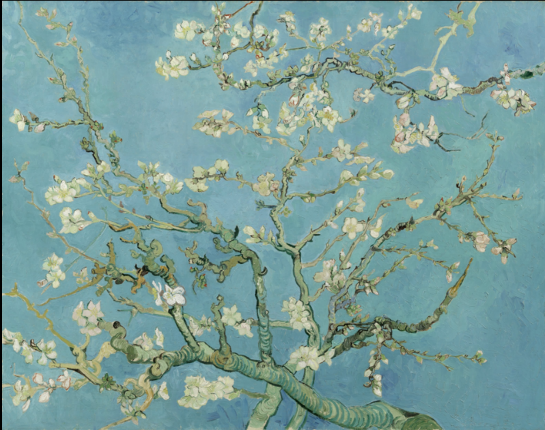
Vincent van Gogh, Almond Blossom (1890) Oil on canvas, 73.3 cm x 92.4 cm