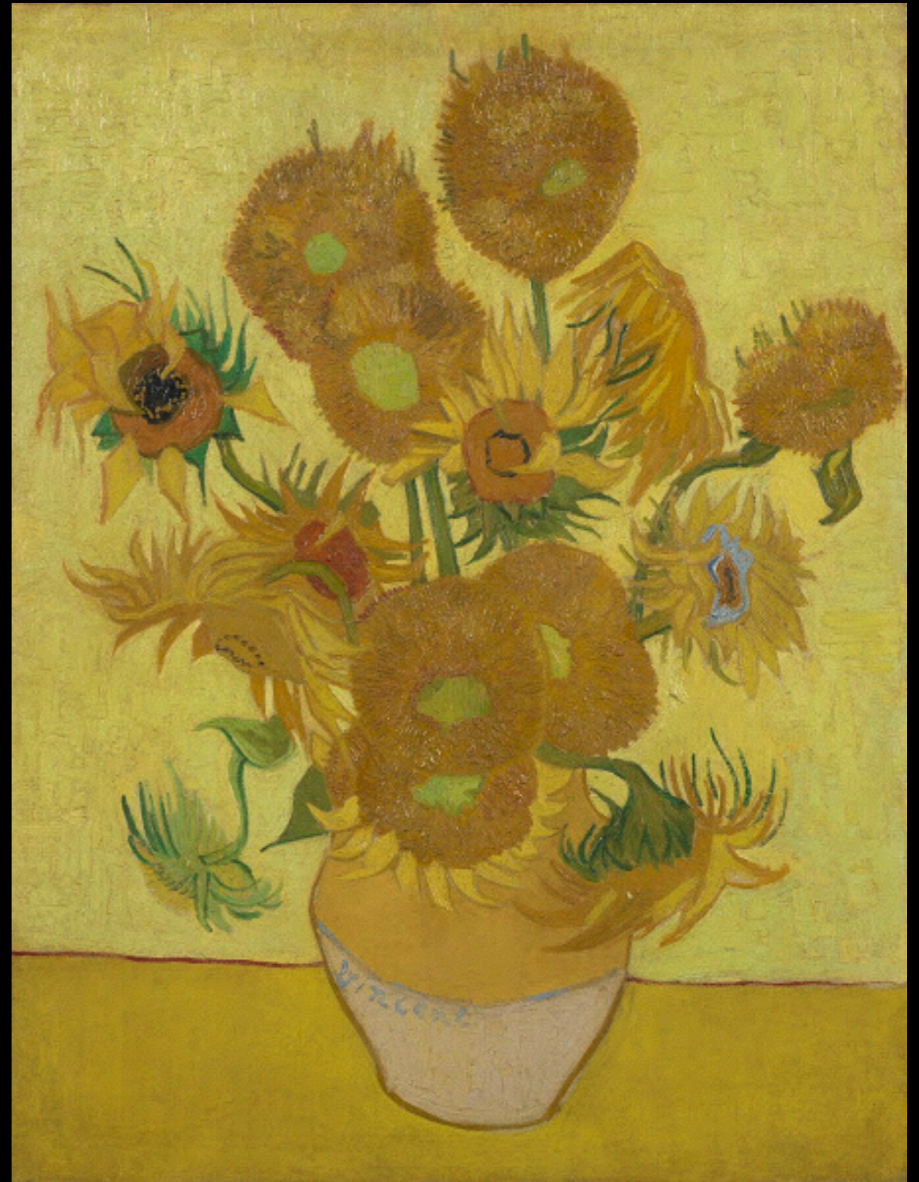
Van Gogh, Sunflowers (1889) Oil on canvas, 95 cm x 73 cm

CLICK: https://www.metmuseum.org/toah/hd/gogh/hd_gogh.htm