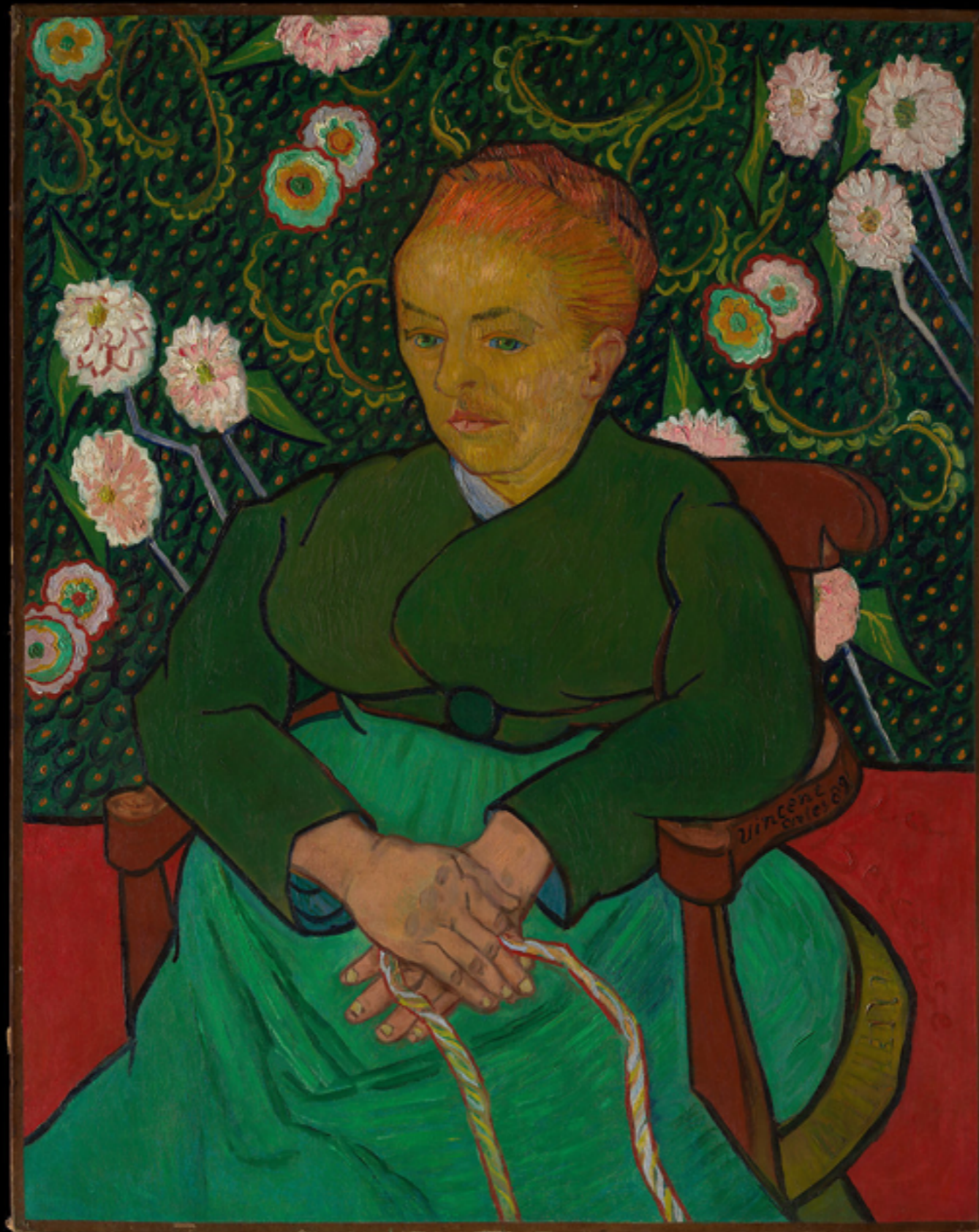
Van Gogh, La Berceuse (1889) Oil on canvas, 36 1/2 x 29 in